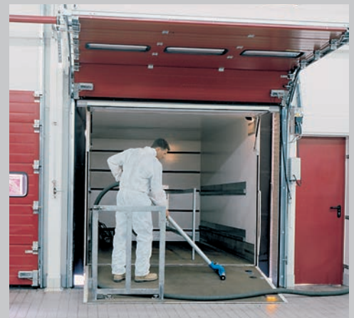
Delivery trucks are easily and hygienically cleaned after their return from the delivery tour.

A highly efficient pocket filter and a cyclonic separator retain even the finest flour particles. Depending on your requirements, units with dust class M or H are available.