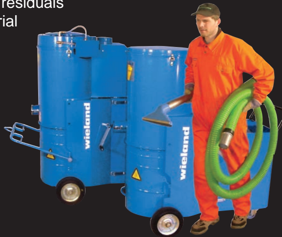
Portable vacuum unit IS-series