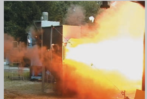
Possible effect of a dust explosion