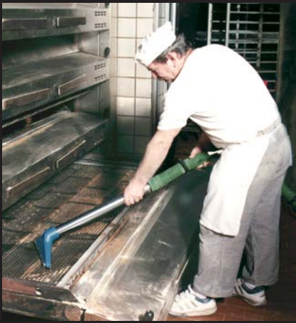
Extraction of baking residuals with an IS-36 industrial vacuum cleaner