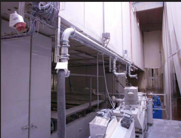
Cleaning of production machinery. Vacuum extraction of flour and bread particles.