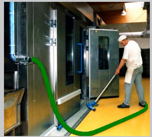
Cleaning of baking equipment with a stationary vacuum system